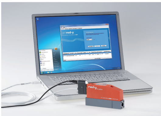
Fig.2 get red-y Software