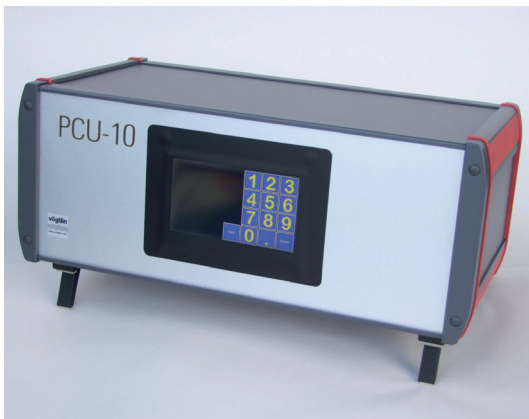
Fig.1 PCU-10 Display and Control Device for the thermal Mass Flow Meters and Controllers of the red-y smart series

The PCU-10 permits the operation of up to 10 flow meters of the red-y smart series with predefined process recipes. The compact control unit with a color touchscreen and integrated power supply comes supplied as a desktop device, switch panel mounting variant or in the 19" plug-in unit. The connected red-y smart meter and controller are automatically detected and displayed with serial number, measurement range and calibrated gas type. The four operating modes single instrument control, gas mixer, master-slave mixer and burner controller are available in English. The saved values are stored in an EEPROM memory which does not require a back-up battery. The desktop case version comes supplied with the PCU-10 , a CD with the get red-y software, as well as the power cord. The front panel mounting variant – and the 19" plug-in unit variant come supplied with a CD, but without a cable.