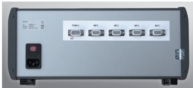
Fig.4 Connections PCU-10 (Art. No. 328-3004)

Desktop case with 4 Sub-D connectors 328-3004 Desktop case with 8 Sub-D connectors (delivery time upon request) 328-3007 Switch panel mounting version 328-3005 19" Rack insert 328-3006 BFC cable for connection of a meter or controller, 2m 328-2163 PDM-U cable for connection to a bus power cable, 2m 328-2169 BAM cable, bus analog module, 0,1m 328-2151 BEC cable, bus expansion cable, 0,5m 328-2160 BEC cable, bus expansion cable, 2m 328-2161 BEC cable, bus expansion cable, 5m 328-2162 BTM terminal plug, bus termination module 328-2139